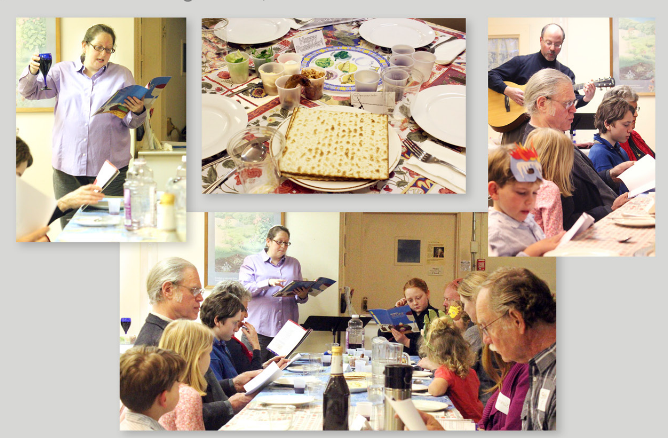
Seder at the Meeting House, March 28th