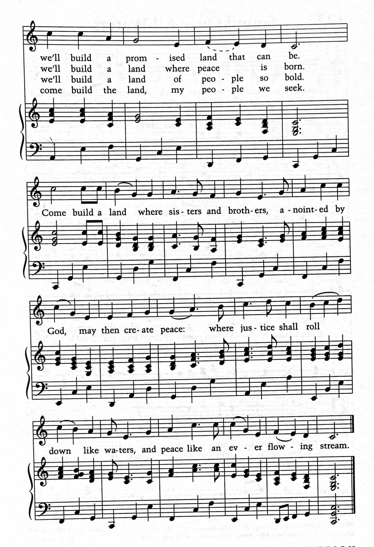
COMMITMENT AND ACTION