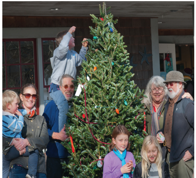
RE students, along with adult members of the congregation, work together to decorate the church's holiday tree in front of the Best of the Beach store near Straight Wharf. Check it out next time you're heading down to the Hy-Line ferry.