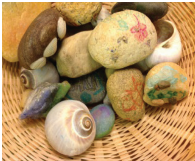
Created by Children in the RE Program