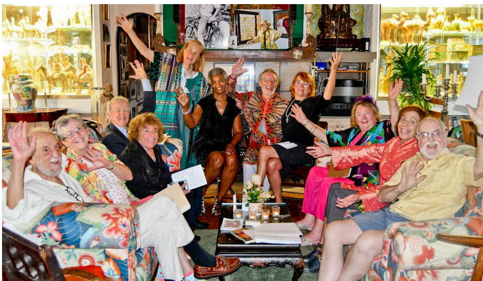
Members of the year-long workshop "A Year to Live" at their Celebration of Life.